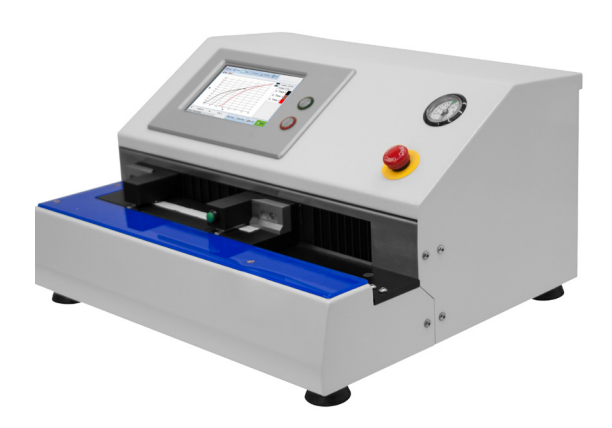
Tensile tester with integrated wet basket for tissue samples