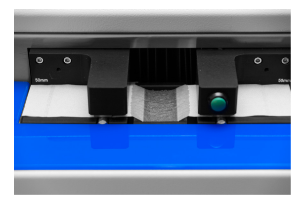
Water bath for wet tensile measurements. Measurements for up to 50 mm wide stripes possible. The tensile test ranges from 50 mm to 180 mm distance between the clamps.