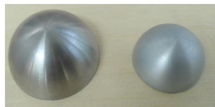
A&B Impact Head