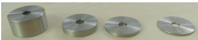
Method A Incremental Weights