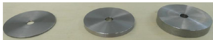
Method B Incremental Weights