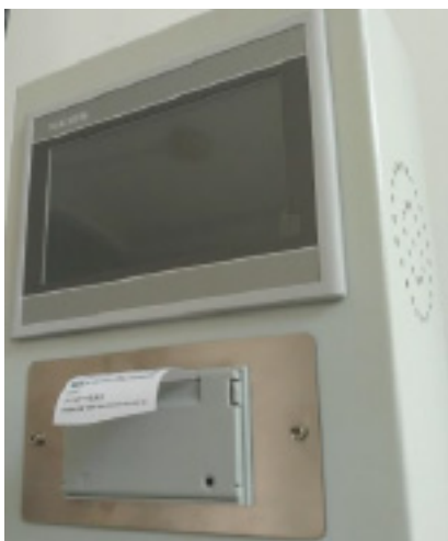
Display & Printer