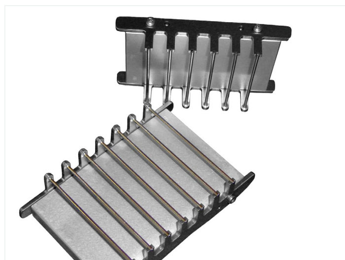
Figure: Pin Adhesive Test (PAT)