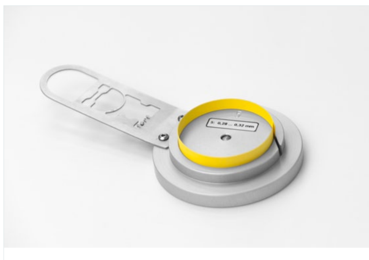
Figure: Ring Crush Test (RCT)