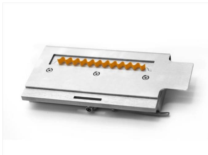
Figure: Concora Crush Test (CCT)