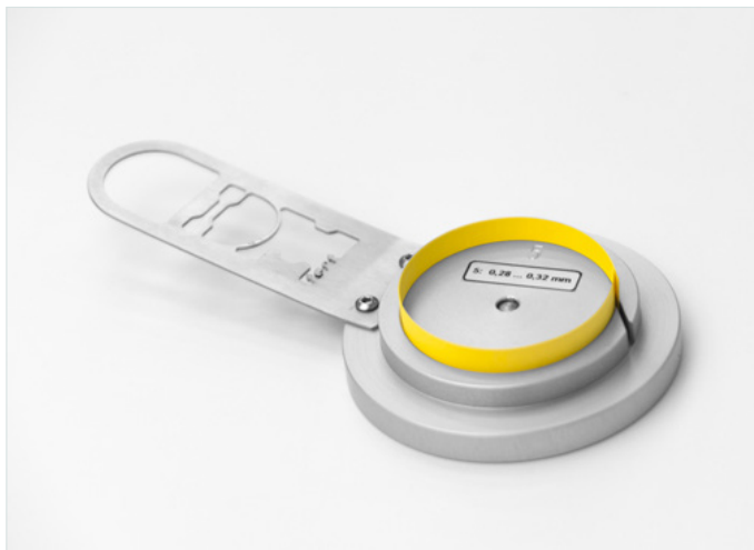
Ring Crush Test (RCT)