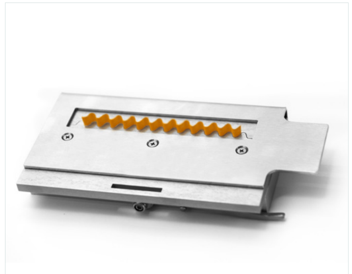
Concora Crush Test (CCT)