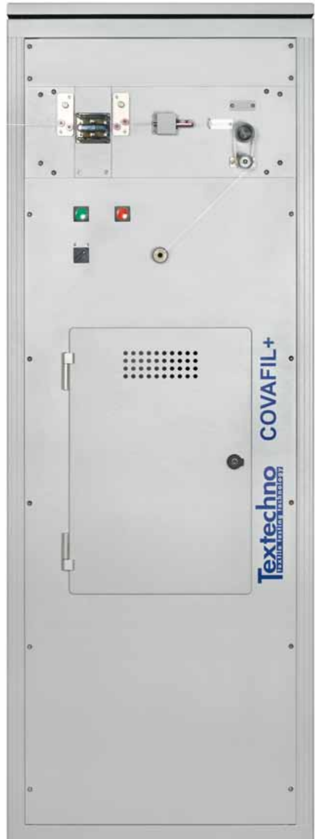
COVAFIL+ Capacitive evenness tester for filament yarn

The concept to operate the COVAFIL+ either as a stand-alone unit or in combination with Textechno's well-proved filament yarn testers DYNAFIL ME and COMCOUNT gives highest testing efficiency and flexibility, as - apart from tensile strength and elongation - all relevant yarn parameters can be determined with one test system, only.