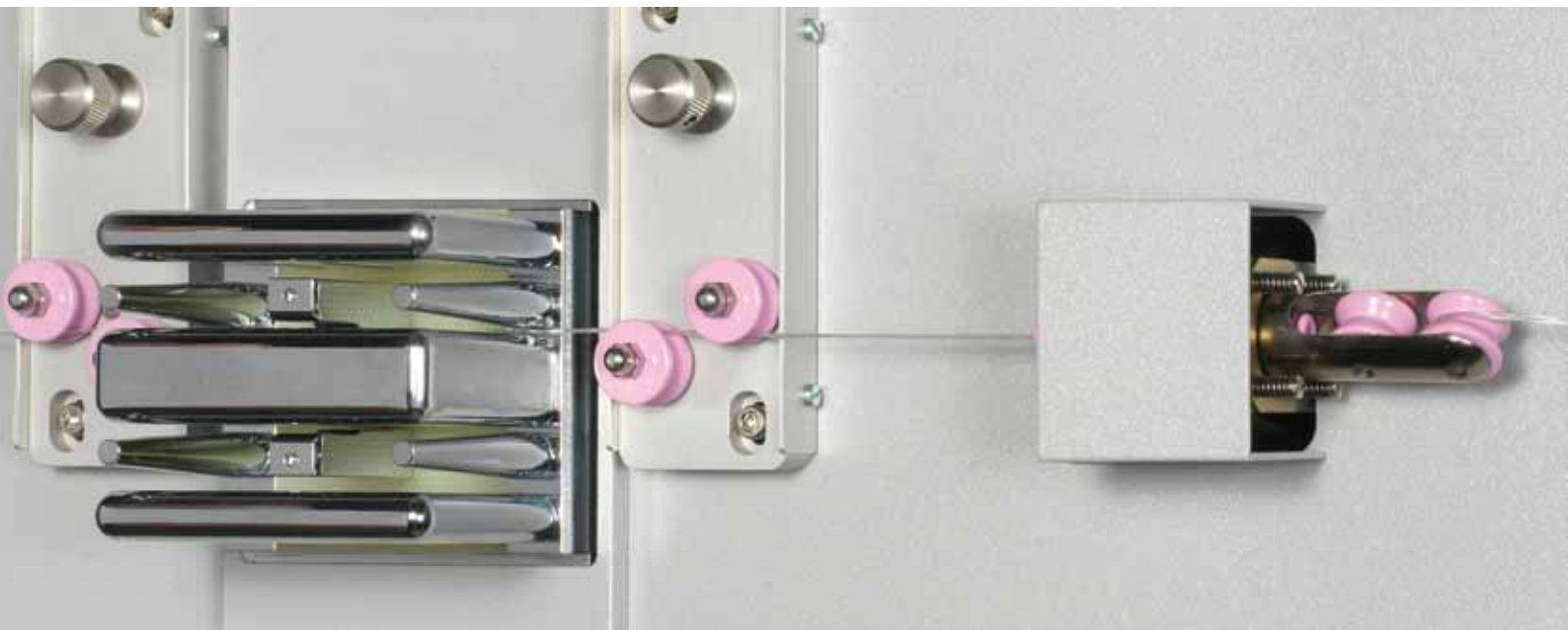
Sensor with Twister